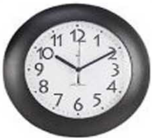
Wall clock WDK-700B (B&W) WDK-700C (color) (Fully functional) * design of housing subject to change without notice